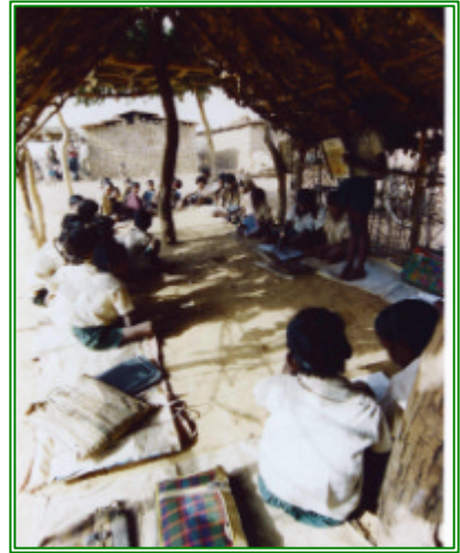
A makeshift Asha school in Village Ahirwani

With a team of young men drawn from the local community, Samrakshan launched the Asha education initiative in 2002, to provide access to primary education in villages hitherto unserved