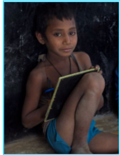
Better days ahead...

We wanted a space of our own to be able to provide our young students with opportunities to go beyond mere syllabus-based learning. We wanted them to have a school where they could play, create, experiment and innovate. We wanted to offer them opportunities to design and implement various project ideas, and to learn as many as possible of their syllabus-based lessons in the outdoor mode – using all of their senses and a variety of media. We wanted to expose them to cutting-edge methods of sustainable agriculture and non-farm livelihood while they were in school, so that adopting these ideas when they grew up came naturally. We wanted them to be close to nature and to a variety of living creatures, so that their natural compassion and care for the wild could get a keener edge. And to do all of this, we wanted a physical space that allowed us the freedom to build, innovate, and unleash our own creativity, so that we could create a school that each child will find joy in attending and will look back upon with fondness later.