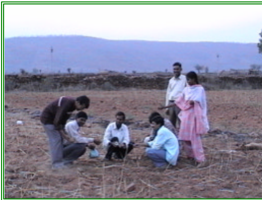
The chosen site for the Adharshila campus

The next challenge, of course, was trying to raise money to build the Adharshila school and campus. After a long process of negotiations, we received the go-ahead from Sir Dorabji Tata Trust, which agreed to support us over 3 years and to meet costs like building construction, creation of livelihood