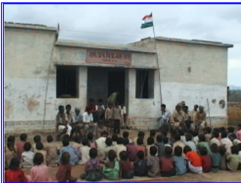
The Asha School, Village Ladar, 2004

by the government's education facilities. During 2002-04, the Asha schools grew and matured, as did the education team at Samrakshan, and by 2004, the Asha schools had become an integral part of the landscape of these villages. More than 500 children have passed through the portals of the Asha schools, and around 60 children have been able to get admission to a regular government-run middle school and hostel, after passing their Class 5 examination as private students tutored by Asha schools.