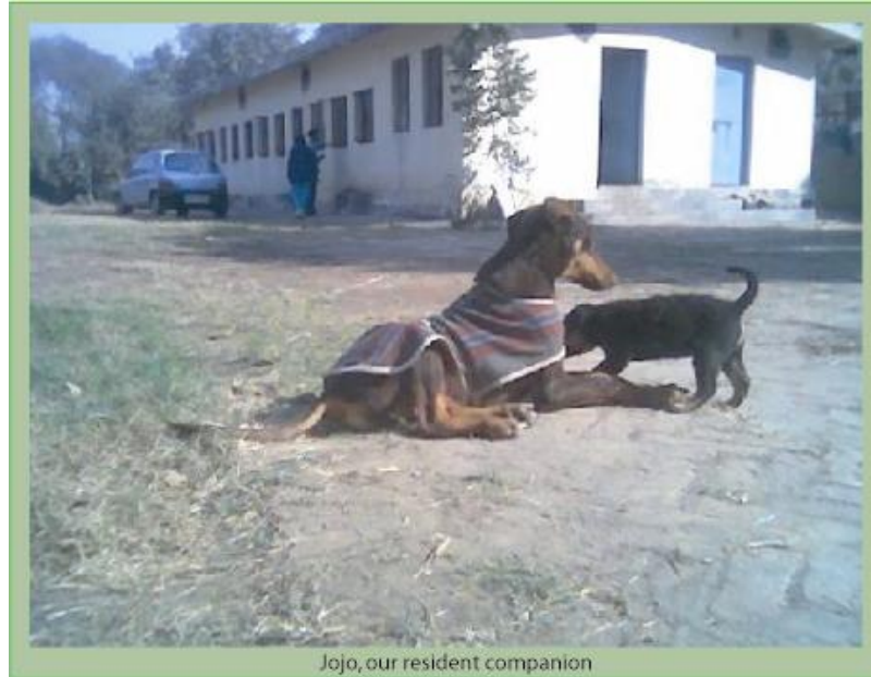
Jojo, our resident companion

Jojo used to be the Most Terrified Dog in History, screaming each time he was approached by mankind (or womankind!). But he has now recovered much of his health,