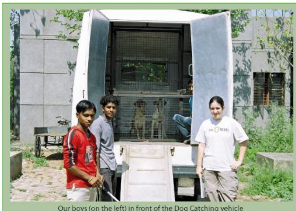
Our boys (on the left) in front of the Dog Catching vehicle

The Society for Stray Canine Birth Control (SSCBC), formed in 2002 to confront the serious civic challenge posed by the growing population of stray dogs, is a collaborative platform shared by the Animal Husbandry department of the Government of Delhi, the Municipal Corporation of Delhi (MCD) and a number of NGOs working in the field of